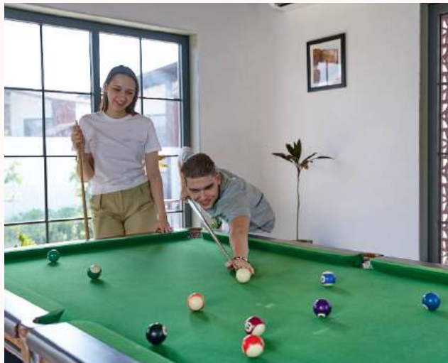
Indoor & Outdoor Event Spaces