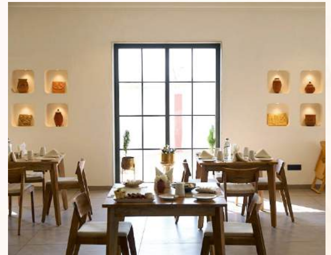
Fine Dine Restaurant