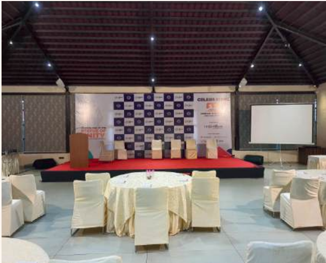
Modern Conference Facilities